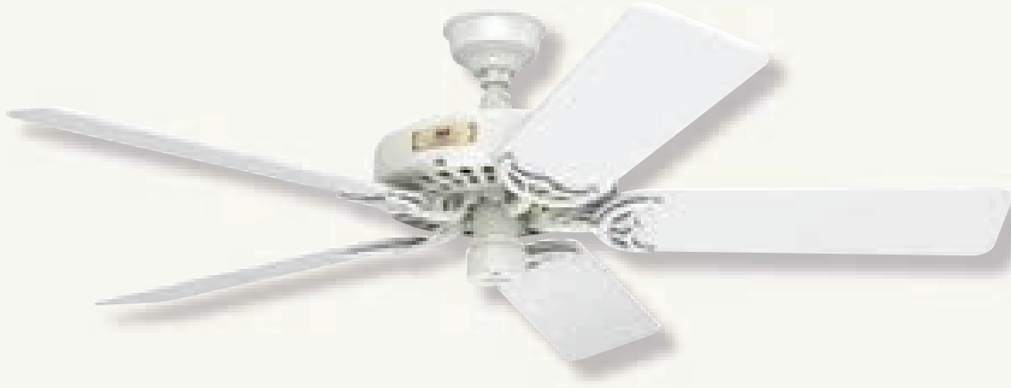
50681 White finish with 5 White blades